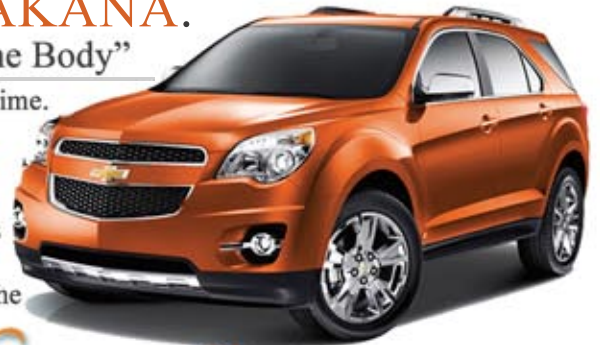
Chevy Hydrogen/Electric Equinox

It has to start somewhere and some time. Why not here? Why not now? The year 2011 will ultimately be known as "The Year of The Electric Car"; the year that mass adoption of this revolutionary clean technology rolled out onto the streets for all to see.